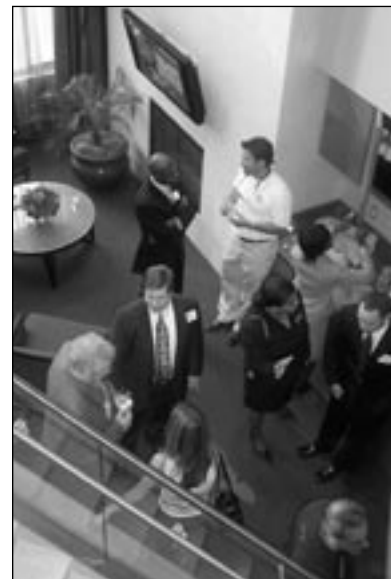
Members Mingle in the Palisades of Bethesda Sky Lounge