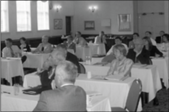
The Board of Directors at the 2005 Leadership Retreat