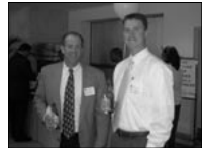
Members Socialize at a Chamber Networking Event

"Bytes of Bethesda" is a service of the Chamber's Technology Resources Committee, which invites members with an interest in current technology trends to join and participate in the committee, which meets the first Thursday of every month in the Chamber's Board Room. Members are also invited to write technology-related articles for the ChamberNews ' "Bytes of Bethesda" column.