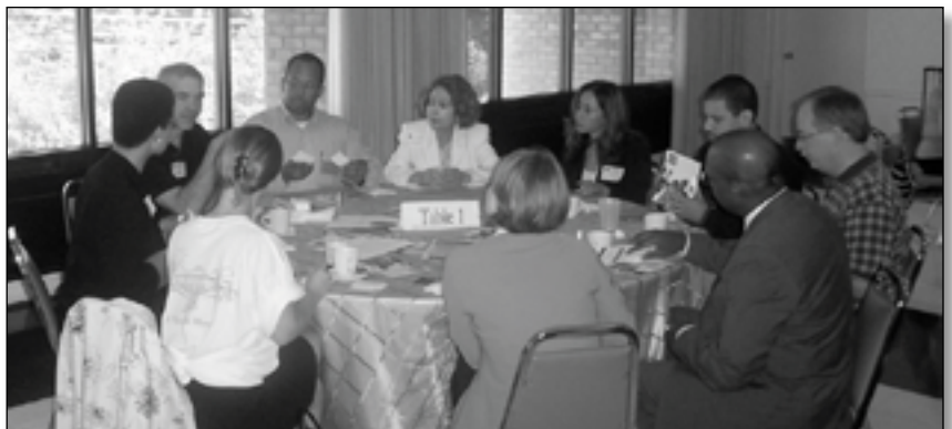
▲ Members Exchange Contacts & Business Cards