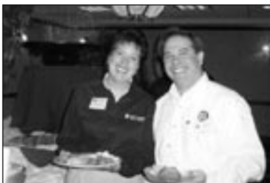
Passport Members at a Power Networking Breakfast