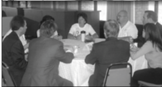
▲ Members and Guests Network at the June Breakfast