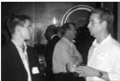
Representatives From Eskeez Design & Wood Street, Inc.