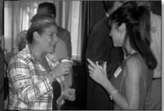
▲ Members Network at the July Business After Hours