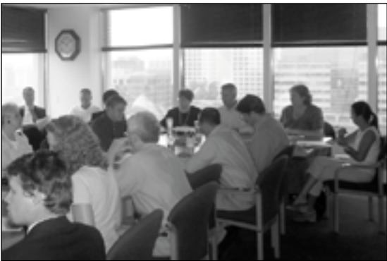
Members Prepare to Bid on the New Chamber Website