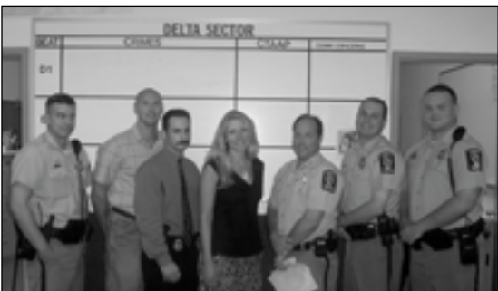
Bi-Annual Police Award Winners