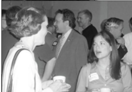
◀ Chatting Over Coffee at the Power Networking Breakfast