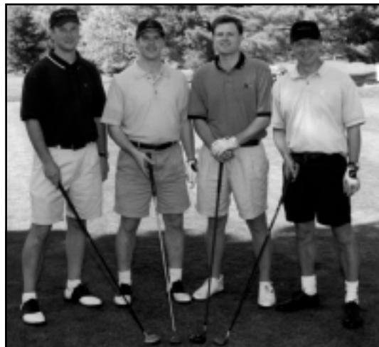
First Place Net Winners, Clark Construction