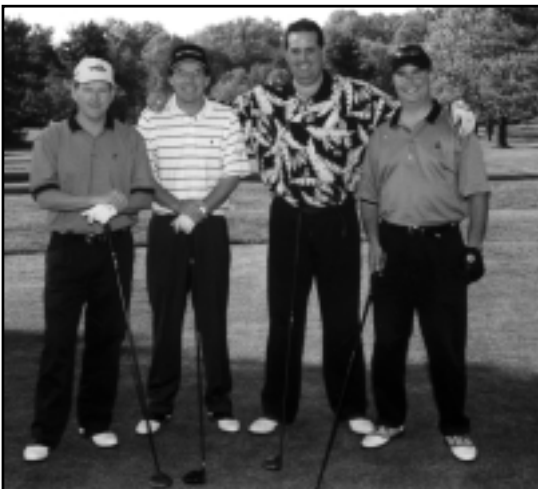
First Place Gross Winners, Bethesda Florist