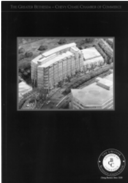
2002 Membership Directory

Don't miss this special advertising offer!! The Greater Bethesda-Chevy Chase Chamber of Commerce will be offering a discount to all members who would like to place an ad in the 2003 Membership Directory & Community Guide. The Guide reaches more than 10,000 potential customers in the Metropolitan Washington area and beyond being distributed in local libraries, the Conference and Visitors Bureau of Montgomery County, BCC Government Services Center, Bethesda Urban Partnership, Department of Economic Development Business Resource Center, Chamber businesses as well as being included in the Chamber's relocation package and more.