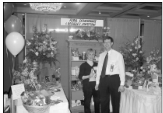
March 18, 2004 — Business & Tech Expo Holiday Inn Select Bethesda