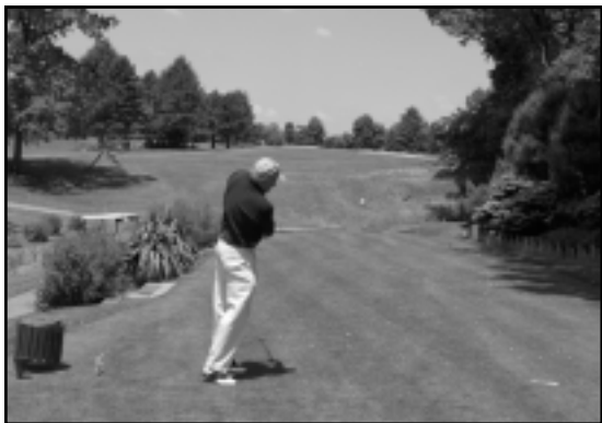
May 17, 2004 — Chamber Golf Classic Manor Country Club