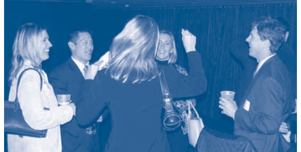
NextExecs enjoying the pre-game party

On Thursday, November 30 at the Verizon Center in Washington, DC. our NextExecs were honored with a last minute visit and presentation by Ted Leonsis, Vice Chairman of AOL LLC and majority owner of the Washington Capitals. Leonsis provided the audience with advice on how to balance career and family, and shared with them his career path and the steps he took to become Chairman of AOL and owner of a NHL hockey franchise.