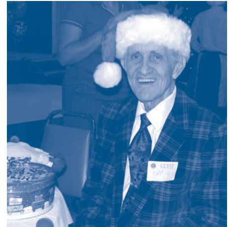
Enjoying the festivities!