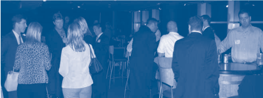
Networking at NextExec's Night at the CAPS

BCC NextExec is a program that provides events and programs designed to engage young professionals of member firms through professional and personal development programs, networking opportunities and community involvement.