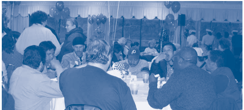
Goodwill Dinner guests enjoy a fabulous feast

And to the many other local businesses and community partners